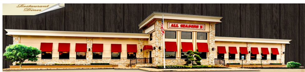
Site of Our Fall Buffet Breakfast

Again, thank you for continuing to support the Central New Jersey Unit.